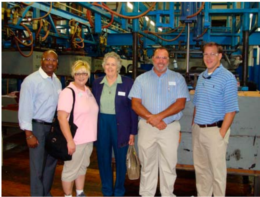
▲ An LCC group taking a tour of Auto Custom Carpets in Anniston.