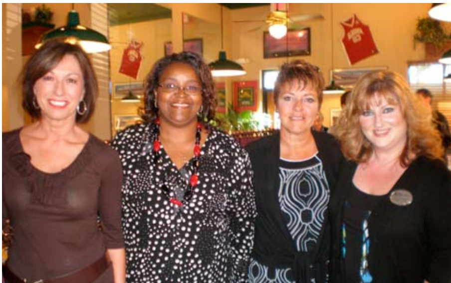
October's Business and Biscuits event was held on Thursday, October 6, at McAlister's Deli with around 30 in attendance.