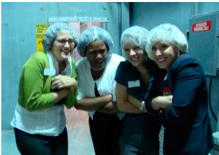
Leadership Calhoun County had their Economic Development/Business and Industry Day this past Thursday. They learned about the status of McClellan, heard from the Economic Development Council, and visited various businesses and industries throughout Calhoun County. Here is ▲ one group in a freezer at Reddy Ice in Anniston.