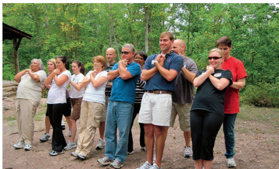
▲ LCC LCC 2011 class members participate in Team Building Day

Leadership Calhoun County (LCC) provides an opportunity to learn about our community through participatory experiences. Apply NOW by calling 256-238-7715, downloading forms from the Chamber website: calhounchamber.com, click on About Us, Chamber Programs, Leadership Calhoun County or emailing lyndaa@calhounchamber.com.